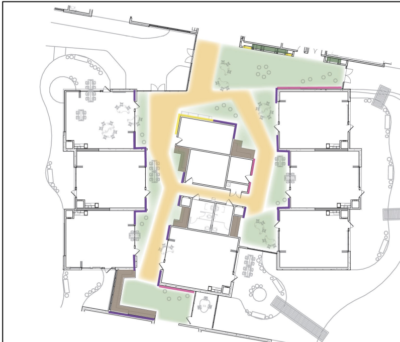
1 st and 2 nd Grade Rendering