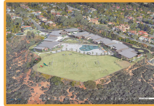
DEL MAR HEIGHTS SCHOOL REBUILD

Measure MM was passed by the community in November of 2018. This general obligation bond will provide $183 million to fund major facilities projects at all schools in the Del Mar Union School District. These projects will be funded through four series of bonds, Series A, B, C, and D. Major projects planned for completion as a part of Measure MM are listed below.