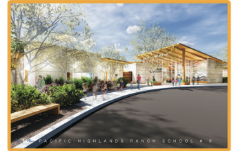
PACIFIC HIGHLANDS RANCH SCHOOL #9